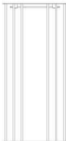
Widok z frontu