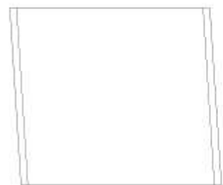
Widok z boku