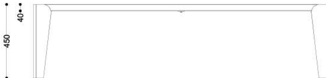
Widok z frontu