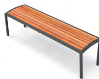
CAMILLA - PW