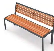
CAMILLA - SW