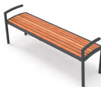
CAMILLA - PWB